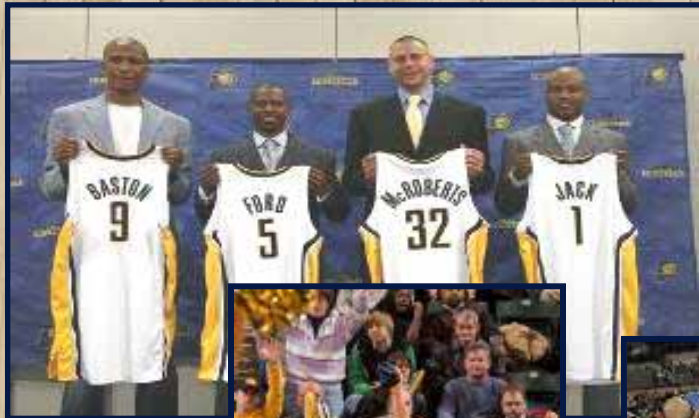
Four of five veterans acquired in trades this summer: Maceo Baston, T.J Ford, Josh McRoberts, and Jarrett Jack

Seven new players have been added to the roster this summer including: