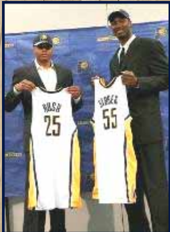
Two first round draft picks: Brandon Rush and Roy Hibbert